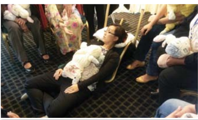
A variety of ways to help a mother maintain breast attachment.

Understanding the influence of delivery room practices on breastfeeding