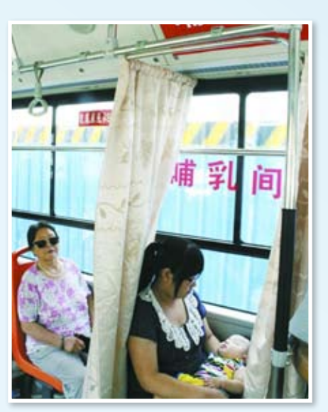
A Chinese city has introduced 'lactation rooms' on its public buses for women who want to breastfeed.