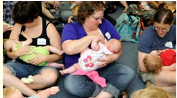
Mothers participate in an earlier Big Latch On event.

http://www2.timesdispatch.com/news/2012/aug/04/2/dozens-gather-in-capital-square-for-mass-breastfeed-ar-2108819/