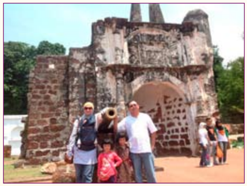
On holiday with the family.

My experience during this 6 month period with my son taught me that biological bonding is greater through breastfeeding (at the breast) and premature separation of an infant from the mother affects both the frequency of breastfeeding and bonding. This is the difference I felt when comparing my previous breastfeeding experiences. From the evidence based lactation facts, breastfeeding provides better immunity and resistance to respiratory and gastrointestinal infections, even viral fever. However, it is achieved through exclusive breastfeeding, not through bottlefeeding expressed breastmilk (EBM). The practice of EBM storage in a freezer destroys the live cells in breastmilk and reduces the effectiveness of the immunoglobulins in breastmilk.