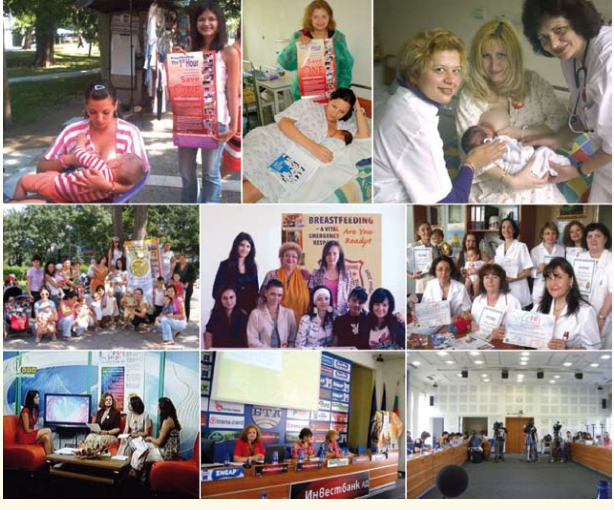
Supporting and Promoting Breastfeeding in Bulgaria.

Our mission is to protect the rights of children and mothers and promote and support breastfeeding. We work to implement this through legislation of the International Code of Marketing of Breastmilk Substitutes and subsequent UNICEF and WHO Resolutions.