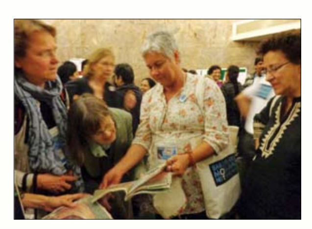
Showing the cloth book to mother support groups.

At the IBFAN LAC booth Amigas do Peito displayed printed materials from MINA (the Brasilian network of support groups for breastfeeding mothers), RUMBA LAC, Breastfeeding News in Portuguese by IBFAN Brasil and the IDEC Brasil magazine that