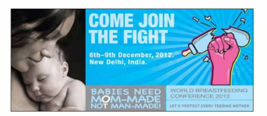
First World Breastfeeding Conference

he First World Breastfeeding Conference, organised by the World Alliance for Breastfeeding Action (WABA) and International Baby Food Action Network (IBFAN), "Babies need Mom-Made not Man-Made", was held in New Delhi, India from December 6-9, 2012. For further information on the conference – reports, presentations, declaration and more, go to http://worldbreastfeedingconference.org