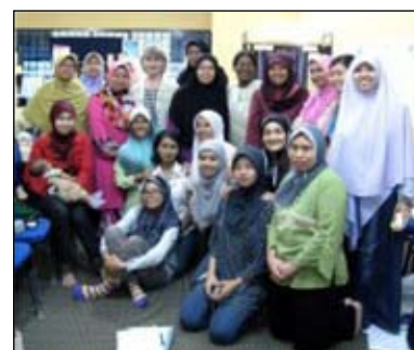
Peer Counselor Programme Administrators.

At the World Breastfeeding Week 2009 event at the Malaysian National Lactation Centre, it was revealed that one of the major causes of failure of the reassessment of Baby-Friendly Hospitals is Step 10, "Foster the establishment of breastfeeding support groups and refer mothers to them on discharge from the hospital or clinic." Currently breastfeeding support groups are formed by hospital nurses adding further to the workload of healthcare professionals without adequately meeting the needs of the mother. Furthermore, mothers are normally discharged 1 or 2 days after delivery. Thus, support activities within the hospital set up is minimal.